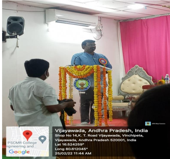
Vijayawada, Andhra Pradesh, India Shop No 14, K. T. Road Vijayawada, Vinchipeta, Vijayawada, Andhra Pradesh 520001, India Lat 16.524259° Long 80.612045° 25/02/22 11:44 AM