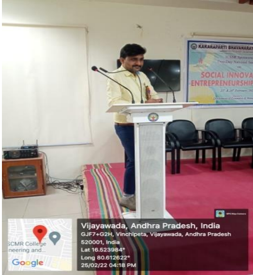
Vijayawada, Andhra Pradesh, India GJF7+G2H, Vinchipeta, Vijayawada, Andhra Pradesh 520001, India Lat 16.523984° Long 80.612622° 25/02/22 04:18 PM