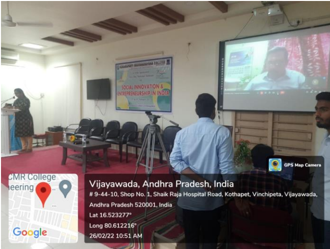
Vijayawada, Andhra Pradesh, India # 9-44-10, Shop No. 1, Shaik Raja Hospital Road, Kothapet, Vinchipeta, Vijayawada, Andhra Pradesh 520001, India Lat 16.523277° Long 80.612216° 26/02/22 10:51 AM