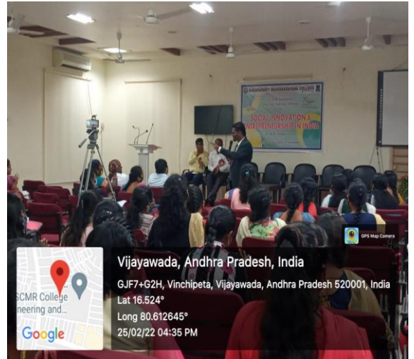
Vijayawada, Andhra Pradesh, India GJF7+G2H, Vinchipeta, Vijayawada, Andhra Pradesh 520001, India Lat 16.524° Long 80.612645° 25/02/22 04:35 PM