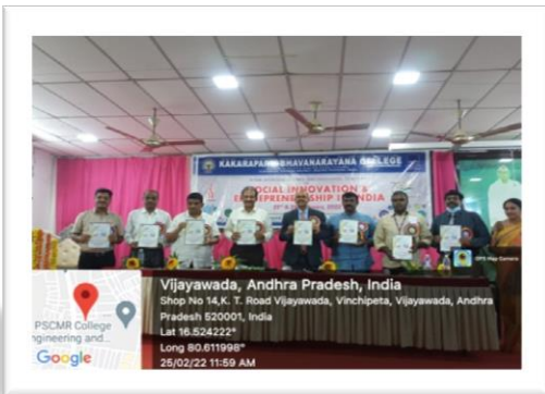
Releasing Of Icssr Volumes By Chief Guest & Dignitaries